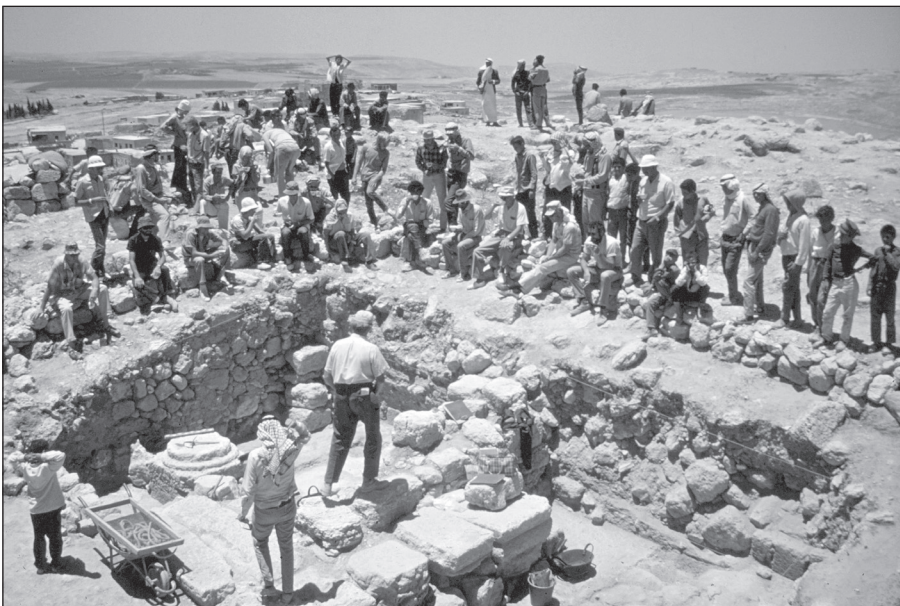
2. Hisbān in the 1970s. Meeting on site with the entire crew.

Similarly, local communities can no longer be viewed only as a pool of potential labor and workmen for archaeological projects. It is incumbent upon archaeological and cultural heritage professionals to provide true vocational opportunities for the communities we engage with, and to educate the local public about the enormous work (and passion) that lies behind the study, presentation, and