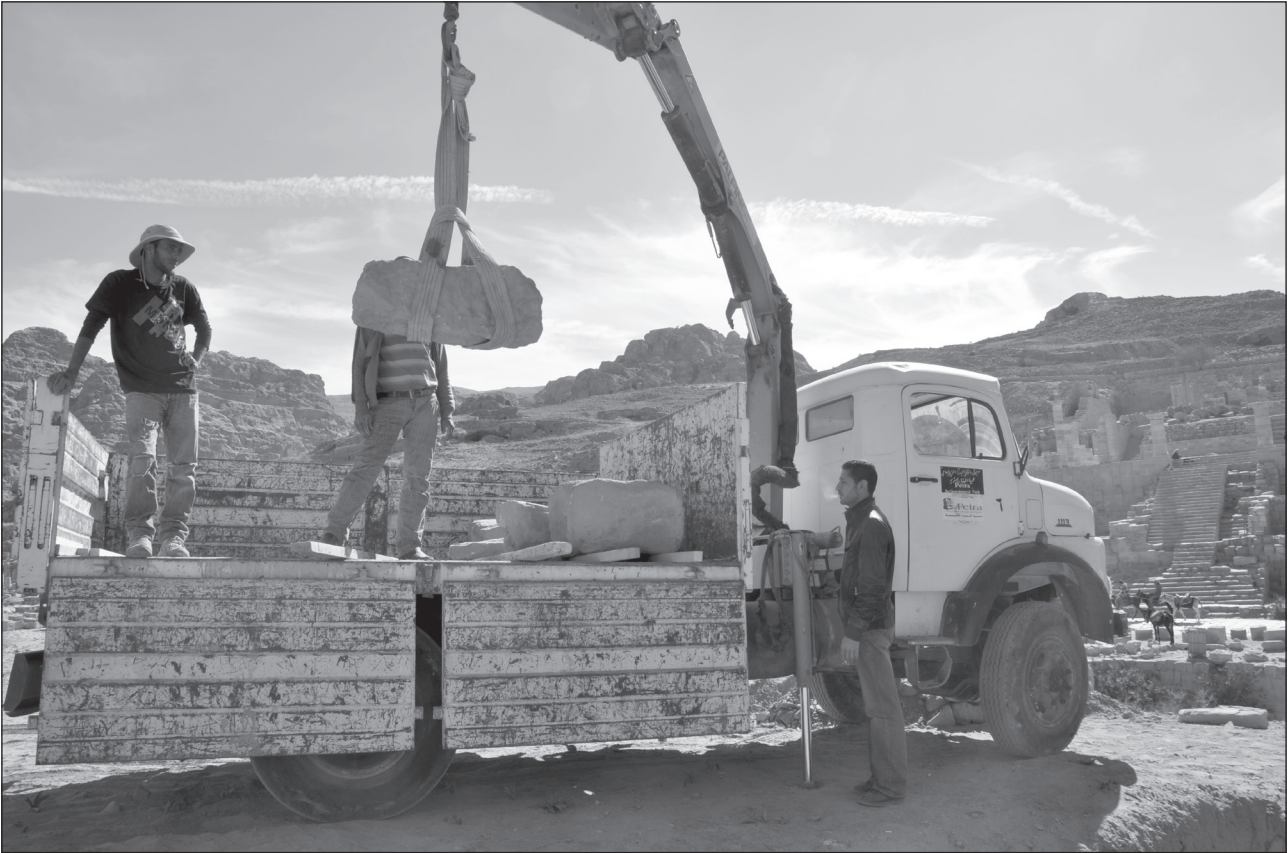
4. The Petra Archaeological Park regularly provides the TWLCRM with heavy equipment to facilitate work on site.

The archaeological documentation trainees register and document stone ashlar recovered from excavation and dump removal. The topographic documentation group, trained by DoA surveyor Qutaiba Dasouqi, uses a total station to create accurate maps of the site. The architectural documentation trainees draw walls, soil sections, and register and document architectural fragments scattered across the site.