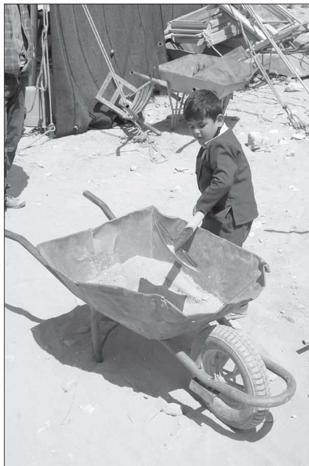
6. A moment from the 2012 Family Day on site.

The day proved so successful that the project provided a similar experience to the Petra National Trust in 2013, during which a group of local teenage students participated in project activities for a day. Such outreach initiatives have