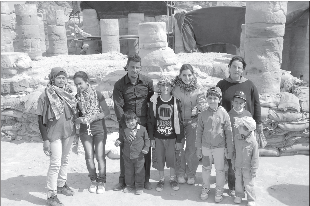
7. A moment from the 2012 Family Day on site.

allowed the project to engage positively with a wide range of communities surrounding the site.