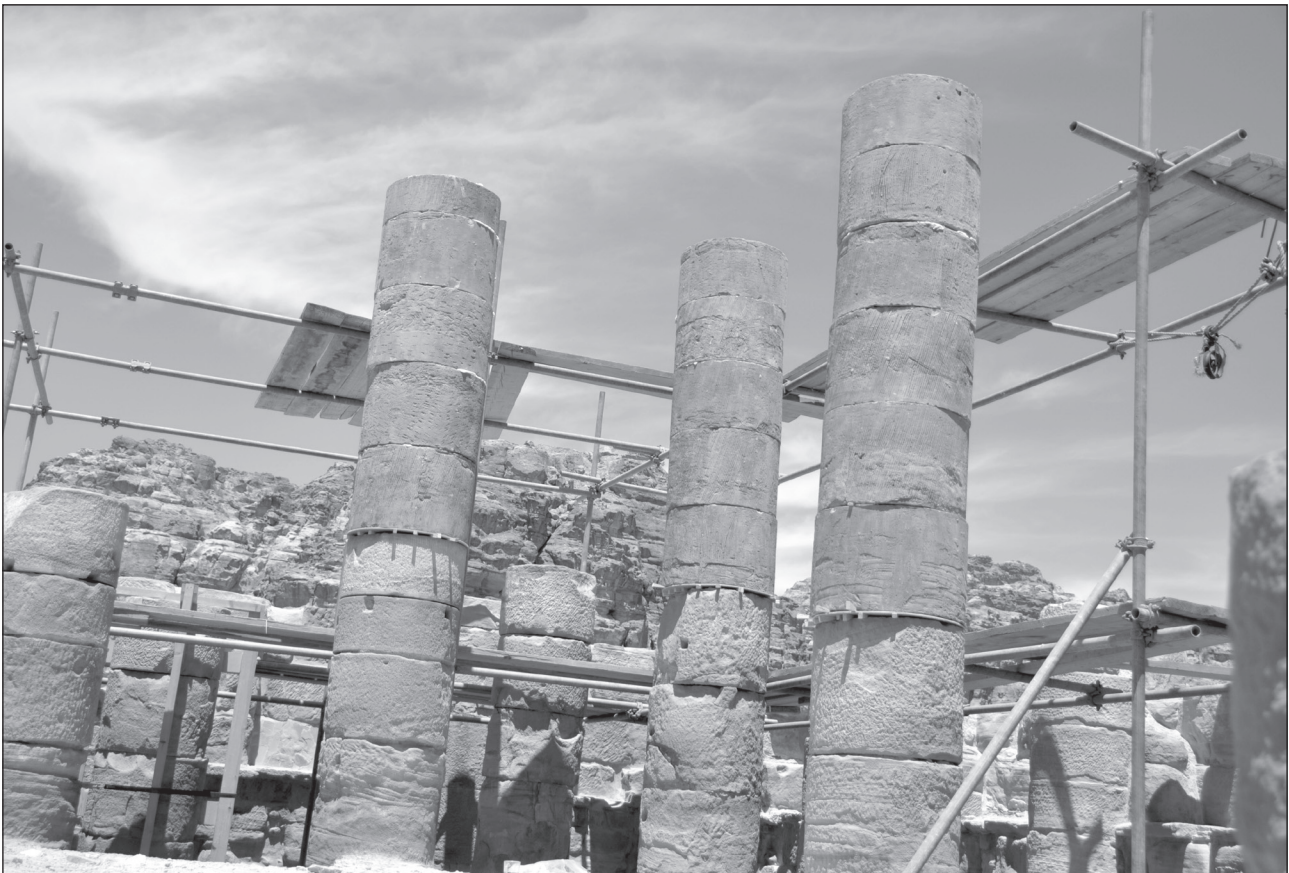
3. Building the model.

and PAP staff to assess the project's progress have had a huge impact on local community members, who are beginning to perceive these public institutions as tangible and effective rather than abstract entities removed from local realities. The local realization that Jordanian institutions are fully contributing partners to the project and its success also serves to reinforce a growing awareness of Petra as a site of both local and national heritage (FIG. 4).